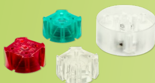
Different coloured discs for type A and B baskets, non-magnetic and magnetic for AutoBaskets