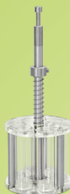
Quick Clean Basket type A (with 6 test tubes or type B with 3 test tubes)