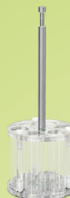
Basket type A (with 6 test tubes or type B with 3 test tubes)