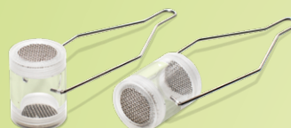
Auxiliary tubes for granule testing, JP pharmacopoeia confirm