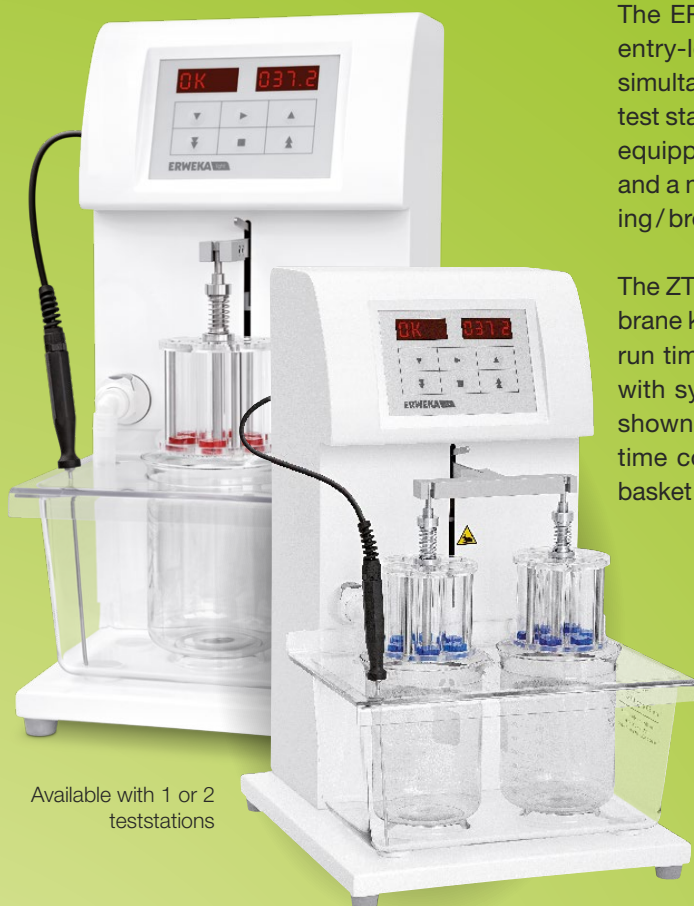
Available with 1 or 2 teststations

The ERWEKA ZT 120 light series are the perfect entry-level disintegration tester with one or two simultaneously motor driven USP/EP/JP compliant test station. The compact unit of our light series are equipped with an integrated flow-through heater and a moulded one-piece PET water bath (no leaking/breaking, easy to clean) with cover.