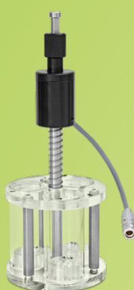
AutoBasket type B (with 3 test tubes, for ZT 720 series only)