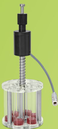
AutoBasket type A (with 6 test tubes, for ZT 720 series only)